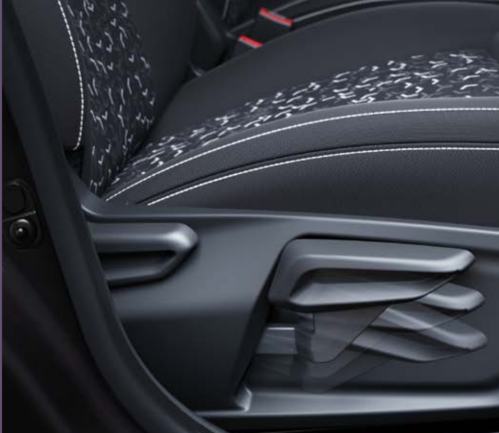
Height Adjustable Driver Seat