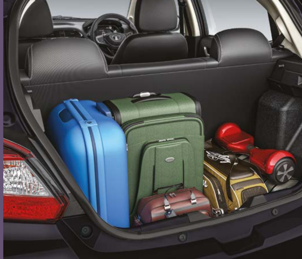
242 l Boot Space