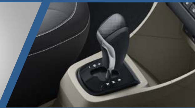
Advance AMT Transmission