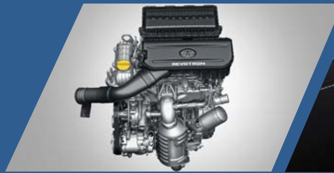
Max Power-86 ps @ 6000 r/min

Who says a peppy drive can't be thrilling? The Advanced AMT Transmission of Tiago lets you zip through any road without shifting a gear. The 1.2 L Revotron BS6 Ph2 petrol engine with the power of 86 ps @ 6000 r/min gives you an all-round performance.